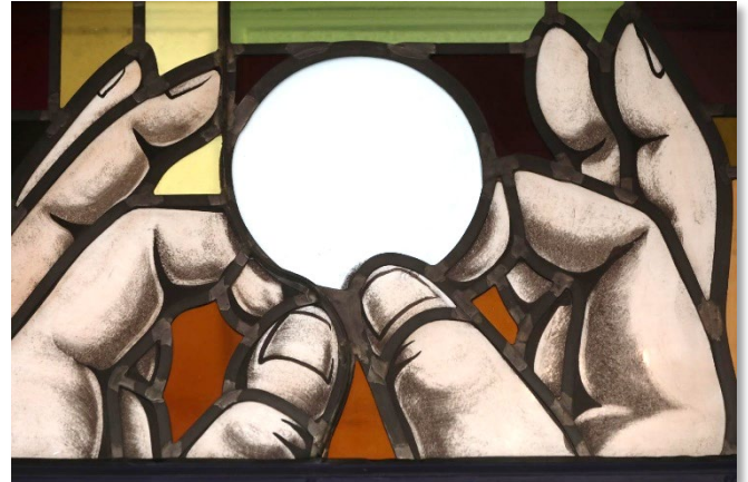
Elevation of the Eucharist is depicted in a stained-glass window at St. Anthony's Church in North Beach, Md., July 15, 2021.